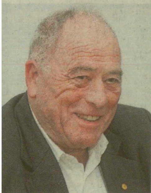
Kurt Wuthrich.